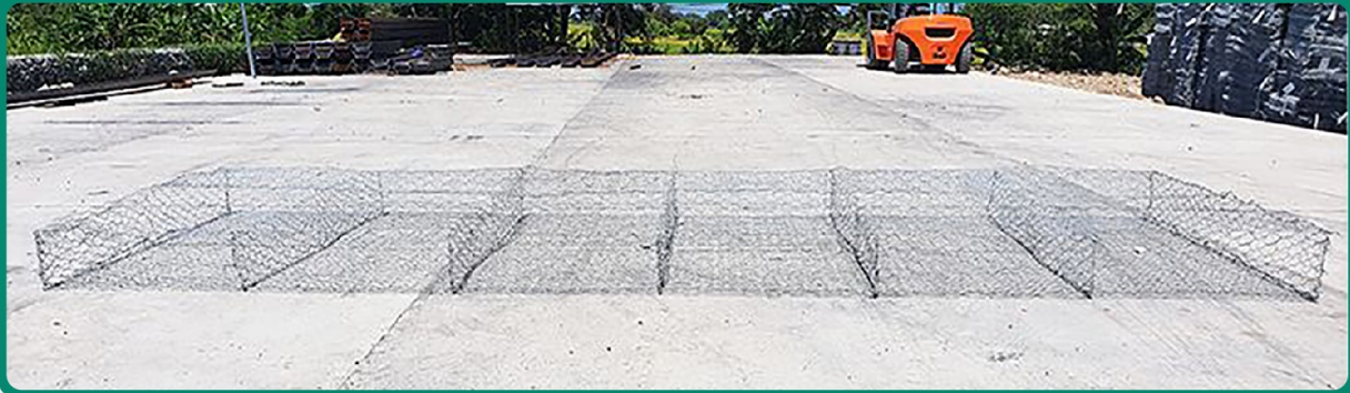
SG 623 6 x 2 x 0.3m